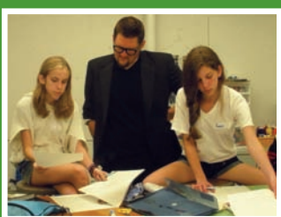
(Jay McCarroll, Project Runway Winner working with camp designers.)

Imagine your child spending her day in the care of warm and loving counselors knitting, crocheting, hand and machine sewing the day away making the most adorable creations. Laying on the floor or nestled under a table, you will see children sharing stories and laughs while stitching snuggly creatures, mermaids in crocheted bikini tops, warm flannel pj shorts or needle-felted sushi. Our camps will envelope your child in creativity, imagination and giggles. Our goal is to teach these wonderful skills in a space where they have fun and are allowed to express themselves. Every week, join us for a different array of amazing crafts. Whether building on old skills or learning brand new ones, our camp is sure to delight.