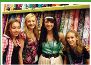
(Campers at Mood in NYC.)