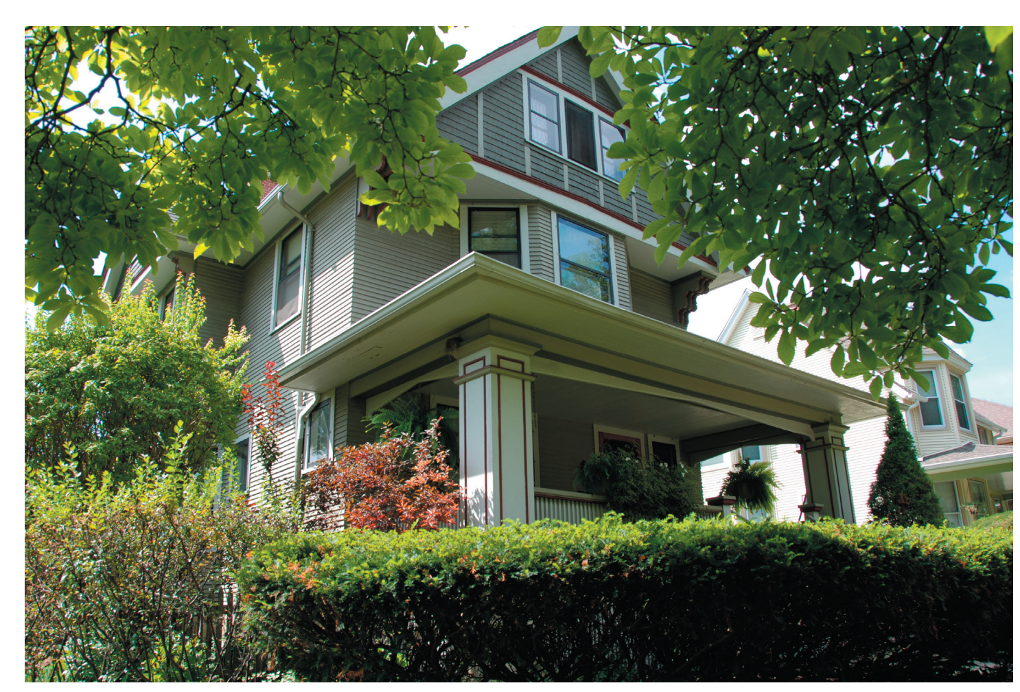
705 North Kenwood Avenue Oak Park, IL 60302