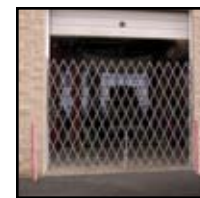
(Single Folding Gates)