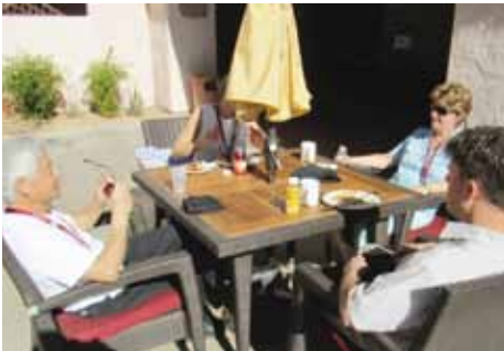
Breakfast and lunch are usually held outside for greater networking.

3. The Westward Look Resort, which offers outdoor meals, poolside discussions, and beautiful scenery, is so popular that LERN members want to come back again and again.