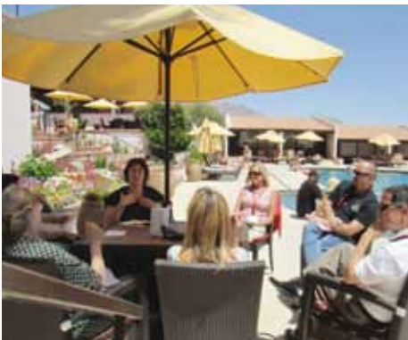
Some small group discussions are poolside.

Join me, some of the top practitioners, and your colleagues in the area of C.E. and credit programming for an advanced Institute with the latest case studies and recommendations on furthering your success in this exciting growth area.