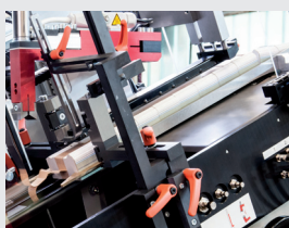
Separating and banding