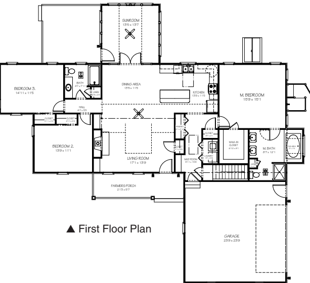
▲ First Floor Plan