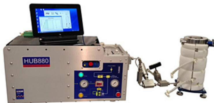
Figure 3 BAROCYCLER HUB880