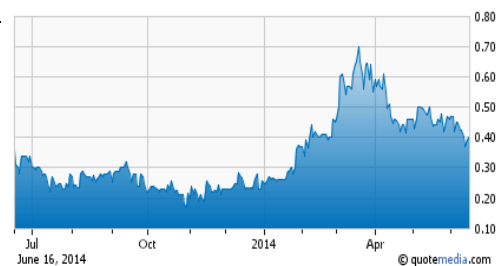
PBIO One-Year Stock Chart