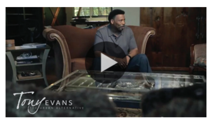
Click here to watch a video to encourage you in your marriage.

Love and respect, offered in grace. When both parties abide by these principles, the marriage will no longer be under the influence of a stronghold because the two will now hold up each other in mutual strength.