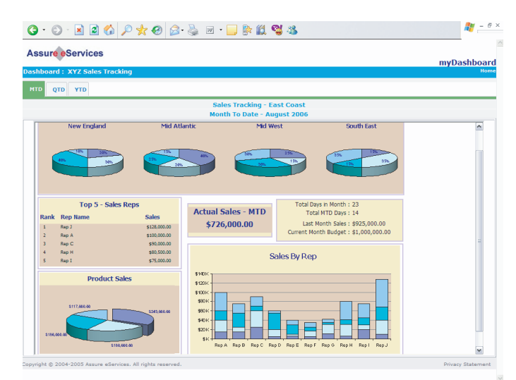
Figure 2: Dashboard View - Sales Tracking

Assure eServices Inc. 35 Corporate Drive, 4th Floor Burlington, MA 01803