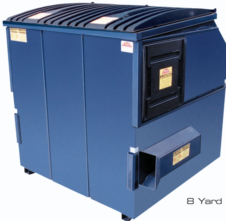
8 Yard Shown