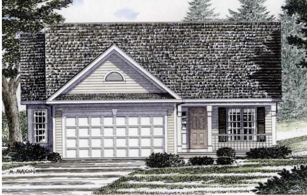
The Harrington 1455 Sq. Ft.