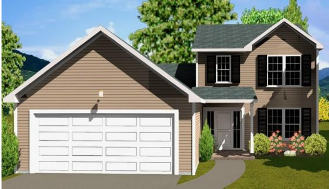
The Hickory 1201SF