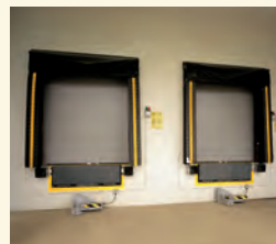
Rolling Service Doors