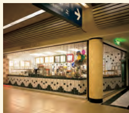
Rolling & Side Folding Security Grilles & Closures