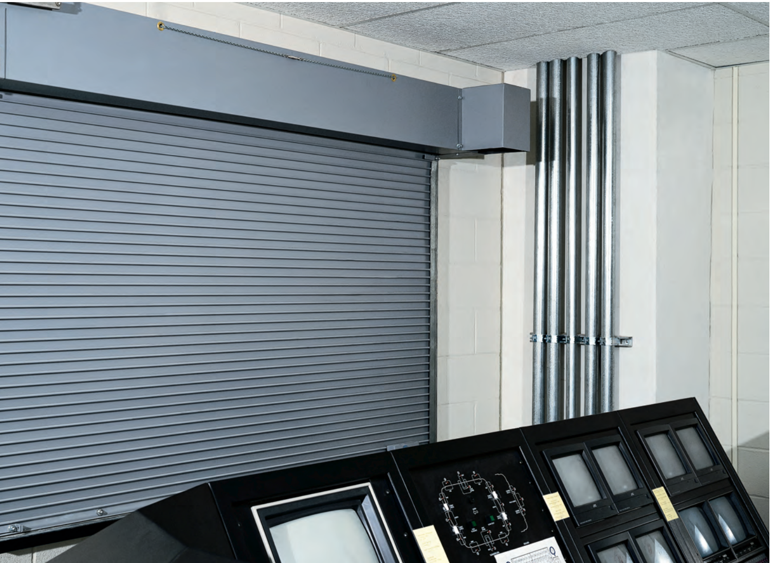
Shown with optional flame baffle for FM