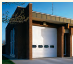
Thermacore® Sectional Doors