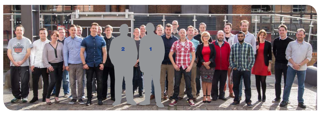
Pictured: One iota Team