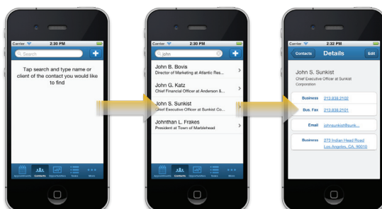
Figure 1: Search for clients and contacts easily.