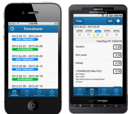
Figure 1: Touch Time for Vision on an iPhone and Android phone