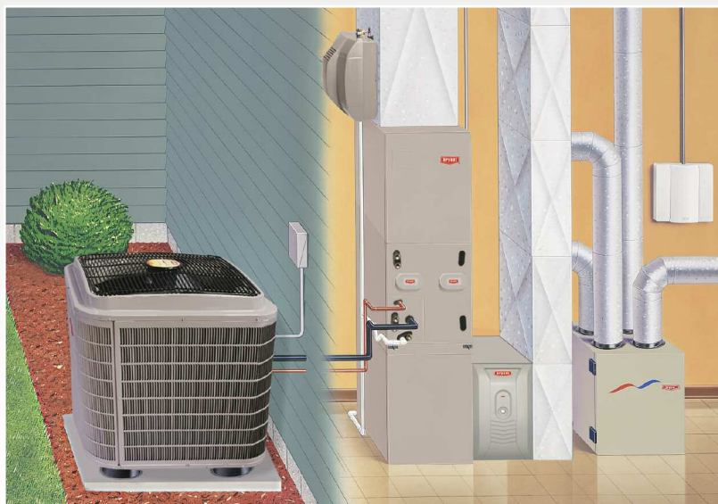
Heat Pump and Fan Coil System