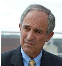
Lanny J. Davis Former White House Special Counsel

Don't miss this unique opportunity to join the nations leading experts in crisis litigation and catastrophic events