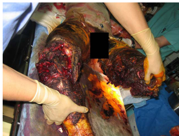
Photograph 1 – Massive blast/amputation/open fracture/thermal burn typical of combat casualties.

In current conflicts, the extensive use of body armor covering the head and trunk, and the introduction of Improvised Explosive Devices (IED) as a weapon have changed the patterns of injuries encountered. Open fractures and traumatic amputation injuries are commonly found in close proximity to thermal burns (Photograph 1). Abdominal Compartment Syndrome (ACS) is increasingly being diagnosed and managed by decompressive laparotomy in the deployed setting [6]. This has created a need for a dressing method that can be used to cover the open abdomen in flight. Operations Enduring Freedom and Iraqi Freedom are the first conflicts where Negative-Pressure Wound Therapy (NPWT) has been available in deployed medical facilities, and this method has been extensively used to treat open wounds, extremity amputations, fasciotomy sites and as a dressing for the open abdomen after decompressive laparotomy. Negative-pressure wound therapy by itself is reported to lower wound microbial counts, but a method of applying a potent and sustained-release antimicrobial dressing under NPWT would be useful for war wounds. Patients with such injuries are frequently flown long distances and handed off between multiple medical teams, precluding serial examination and frequent dressing changes.