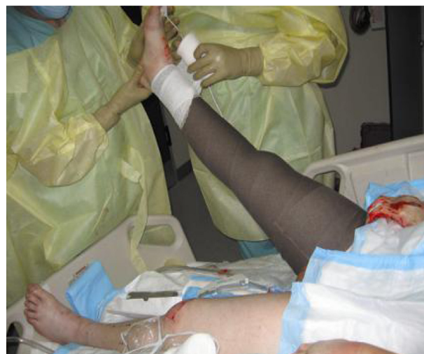
Photograph 3 – Silver-nylon dressings being applied by the Burn Flight Team at Landstuhl Regional Medical Center (Germany) prior to 13-h flight to USA.

dressing change pre-flight the following day (Photograph 3). With the silver-nylon dressing technique, if the aircraft was delayed or diverted, there was no need for an additional burn dressing change in flight. The silver-nylon technique soon became the standard treatment for aero-medical evacuation. Silver-nylon burn dressings are presently positioned at every US military hospital along the evacuation route, including Landstuhl Regional Medical Center and Bagram Air Base. The technique has been adopted by US Air Force Critical Care Air Transport (CCAT) Teams and is taught at the US Air Force School of Aerospace Medicine CCAT Basic Course.