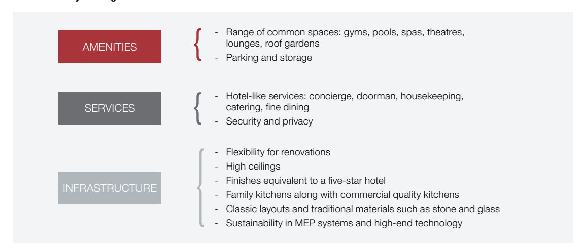
EXHIBIT 3 Trends in luxury housing markets