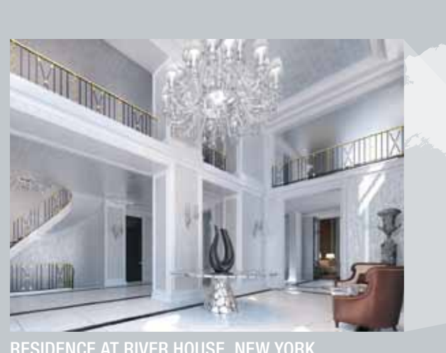
RESIDENCE AT RIVER HOUSE, NEW YORK