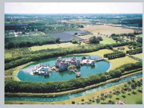
CHÂTEAU ARTISAN, MIAMI EWM REALTY INTERNATIONAL