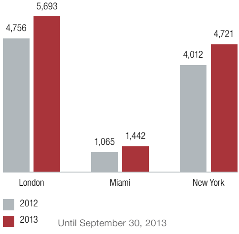
EXHIBIT 1 Sales Volume in London, Miami , and New York Aggregate number of luxury units sold

Sources for Exhibits: Strutt & Parker; EWM Realty International; Brown Harris Stevens.