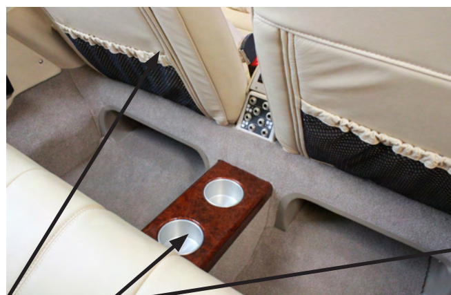
Rear seat pockets hold cell phones and magazines. Cup holders have Walnut Burl or Carbon Weave accents