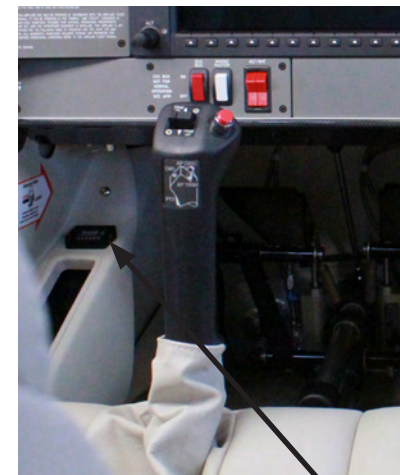
The Hobbs meter is located just ahead of the pilot outboard storage pocket.