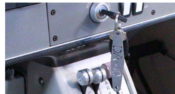
The trim panel on the lower edge of the instrument panel is styled in Carbon Weave or Walnut Burl to match the trim wheel cover and other accents, and connects to the center tunnel.