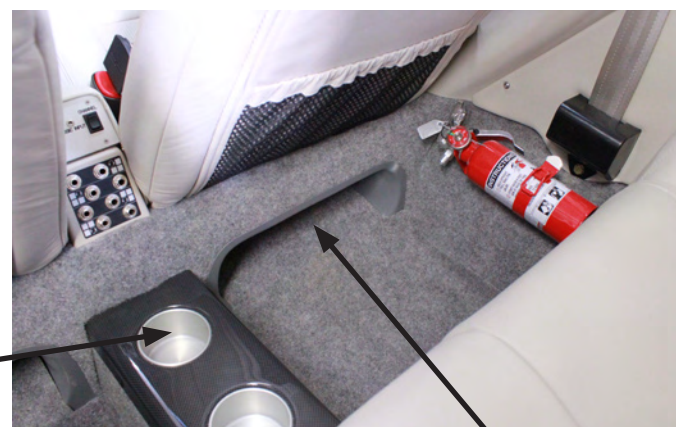
Redesigned footwells allow passengers to stretch out and the MP3 / XM radio jack is conveniently located with the headphone jacks.