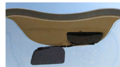
Rosen see-through sunvisors reduce heat and glare.

The lower seat cushions and seat back covers easily remove for cleaning or to be replaced.