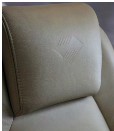
Embossed, padded headrests

Seats have been redesigned for improved lumbar contour.