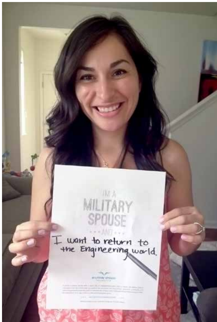
"I'm a military spouse and I want to return to the engineering world."