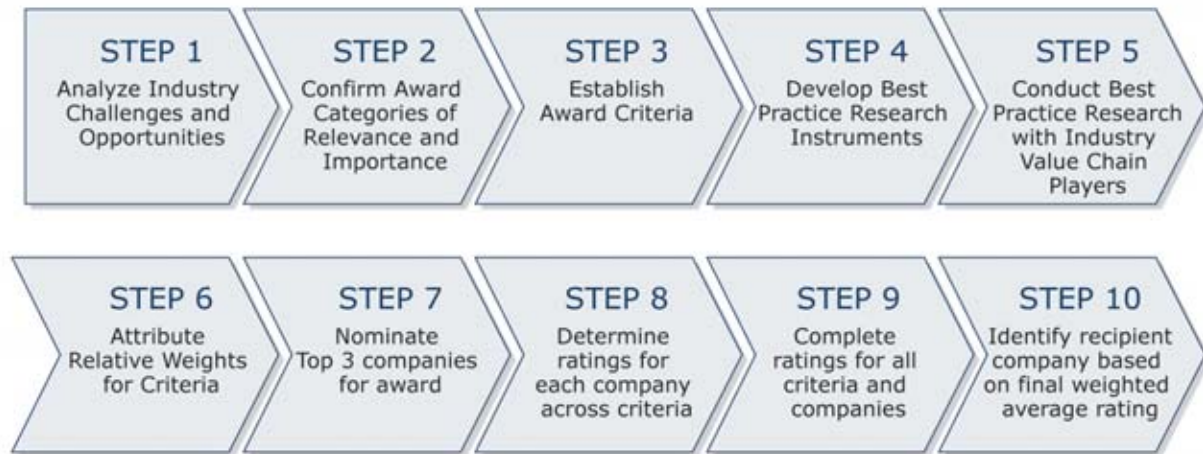
Chart 2: Frost & Sullivan’s Process for Identifying Award Recipients