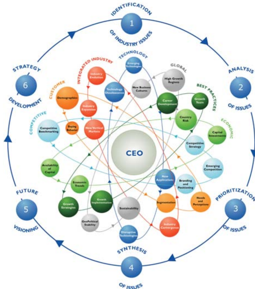
Chart 4: CEO's 360-Degree Perspective™ Model