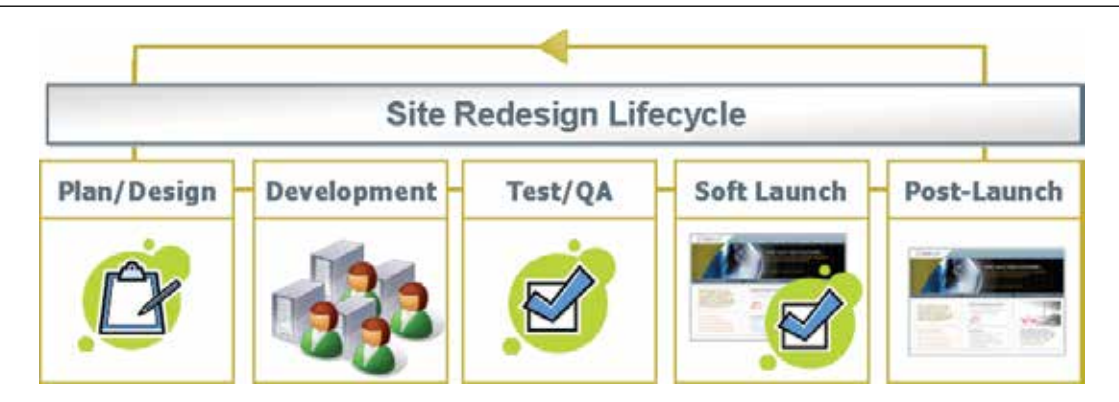
Figure 1: IBM Tealeaf solutions can help you conduct proactive discovery and analysis of customer experience issues throughout the site redesign lifecycle.

As a market-leading Customer Experience Management solution provider, we afford world-class visibility into your customers' online behavior – valuable information that helps you identify and resolve issues quickly, make more informed site optimization decisions and, as a result, dramatically reduce the risks involved with site changes. In this white paper, we explain specifically how IBM Tealeaf solutions can be used to shorten the period of post-launch turmoil. Further, we describe how companies can integrate IBM Tealeaf solutions across the redesign lifecycle – and in doing so, save money and make better site decisions now and in the future.