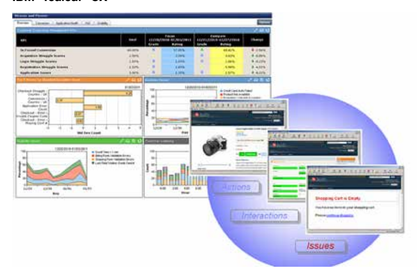
Figure 2: IBM Tealeaf solutions provide quantitative, aggregate metrics about your online business, as well as the ability to replay actual customer site visits – qualitative data of the real user experience.

With IBM Tealeaf solutions organizations have the qualitative and quantitative data that is essential to mitigating the risks involved with site changes and to improving the end results for redesign projects. For the majority of our customers, this data is most critical post-launch (or, for more fortunate companies, during the soft launch or stabilization period). During this time, IBM Tealeaf solutions provide some of the fastest means available to find and resolve a wide range of problems before they can degrade customer success on your site.