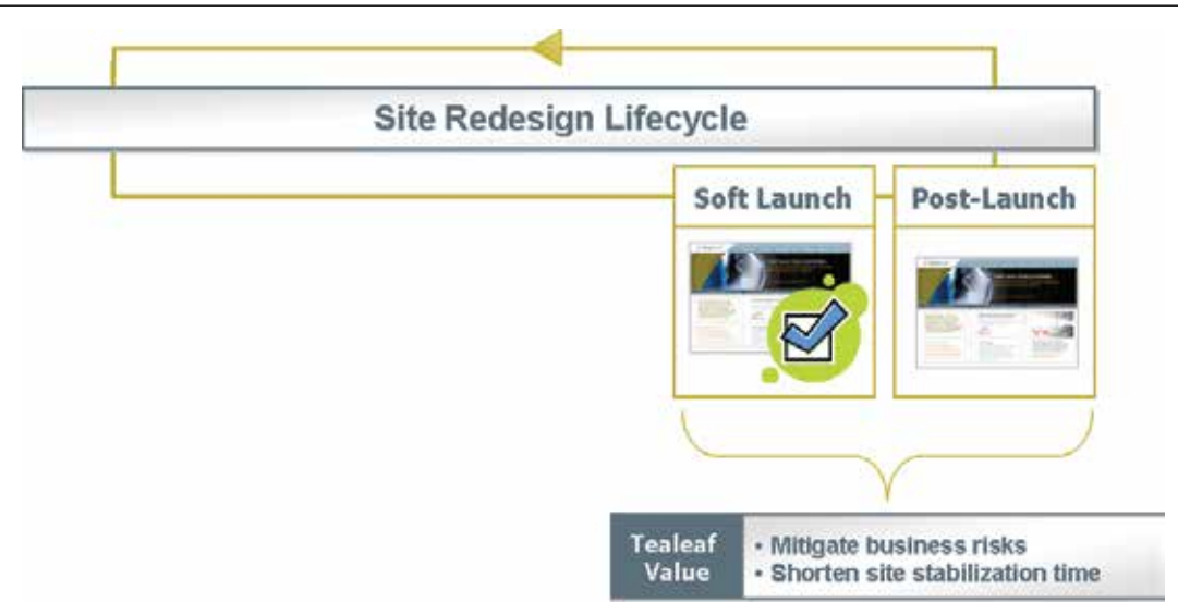
Figure 3: Customer experience management data is critical in reducing soft launch or post-launch turmoil