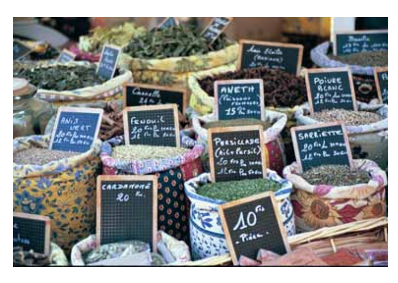
FIGURE 1: Culinary herbs at the spice market in France.