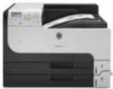
(HP LaserJet Enterprise 700 Printer M712dn)