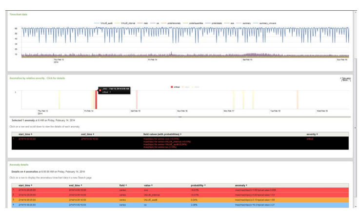
Hover over an anomaly for more detailed information

Some existing implementations of this form of machine learning often used in IT management require the user to define important relationships between things like hosts, VMs, OSes and networks. This requirement made supervised machine learning impractical in situations where the structure of the observed systems changes over time or the user cannot adequately define the relationships. Many early machine learning products for IT monitoring purposes, for instance, take months to implement and need remodeling every year or so.