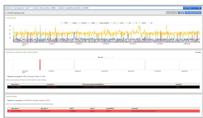
Take data from multiple sources (top chart) and crosscorrelate it to see what systems were impacted together to cause such a big anomaly score

IT operations and application performance management (APM) professionals are responsible for monitoring large (and constantly changing) IT systems of networks, computers, servers, applications, middleware, databases, web servers, cloud servers...the list goes on. Most of these components generate a huge volume of data that describes their behavior and performance and the behavior of those who use them.