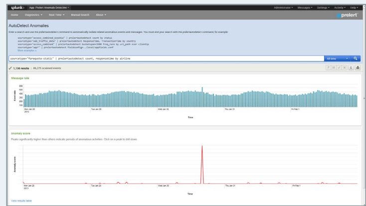
Anomaly Detective's AutoDetect feature takes the response time data above (in blue) and maps out the anomalous behavior it detects below (in red).

Anomaly Detective is a powerful machine learning analytics product that layers on top of data aggregation technologies like Splunk. Anomaly Detective automatically establishes models of normal behaviors it observes in huge volumes of data. It then uses highly accurate statistical analysis to identify anomalies in those behaviors and provides correlated results back to the user that explain the rarity, severity or impact of the outlier data. In IT environments, for instance, Anomaly Detective rapidly identifies the outlier behaviors that could indicate performance problems or security threats. Anomaly Detective makes the forensic analyses, troubleshooting and proactive monitoring efforts vastly more efficient by eliminating the time-consuming need for humans to mine the data through search or configure monitoring thresholds for alerts.