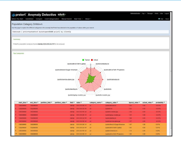
Use Population Category Drilldown to check for anomalies in the behavior of system users

Besides storing this data for compliance reasons, most teams attempt to analyze it to detect successful attacks, rogue users or advanced threats. Unfortunately, the techniques used to analyze this data include: