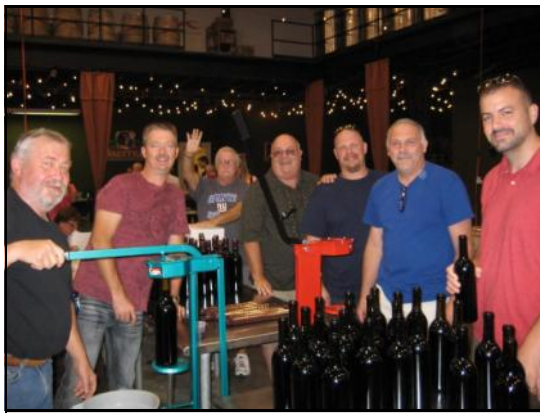
Even the husbands take part!