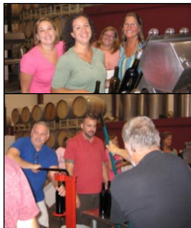
Filling the wine bottles and inserting the corks