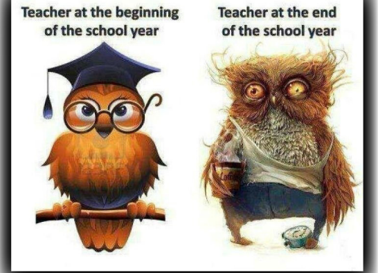
The school year is almost over!! Our thanks to all the educators who gave their ALL to the students this past school year. You folks make a difference!!

332 Route 9 | Forked River, NJ 08731 www.hauswirthinsurance.com 609-693-3123 | 877-329-3261