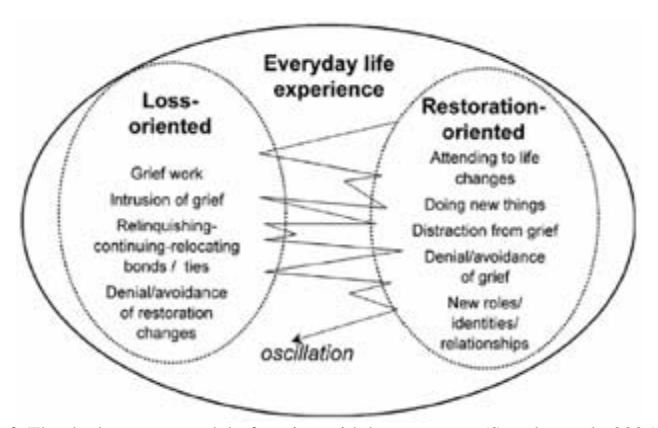
Figure 1. The dual-process model of coping with bereavement (Stroebe et al., 2005, p. 51)

an indirect consequence of the bereavement, for example, changing identity and role from "wife" to "widow" or mastering the skills (e.g., cooking and dealing with finances) that the bereaved had contributed to a marriage. The range of additional psychosocial changes or transitions that the person continually has to grapple with after a major loss has been well documented in the literature (e.g., Parkes, 1996). Restoration incorporates the rebuilding of shattered assumptions about the world and one's own place in it, just as loss orientation incorporates rebuilding of assumptions about the presence of the lost person in one's life (Janoff-Bulman & Berg, 1998).