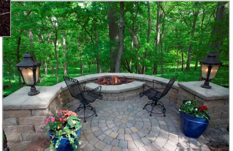
This past summer, the landscape served as a beautiful backdrop for a wedding! CM's is excited to have been able to provide the setting for the event.