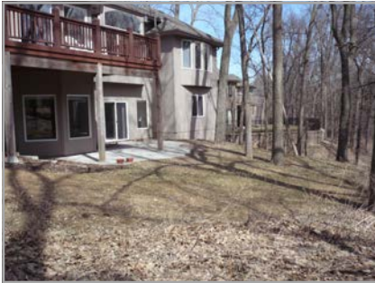
Before CM's started landscaping this house in 2009, this standard walkout backed up to a heavily wooded area.

Every year we enjoy looking back at the projects our clients have entrusted us with and we look forward to the new relationships we will build in the coming year. We are happy to present you with our year-in-review issue and wish you a very happy new year!