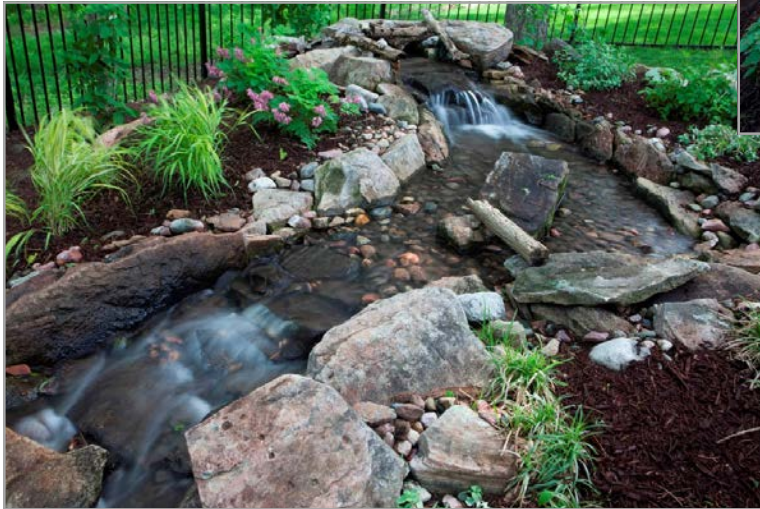
Over the past several years, CM's renovated the backyard to include features to provide the homeowner with additional areas to enjoy the wooded setting including a water feature, fire pit, paver patio with seat wall, landscape beds, boulders and lighting.