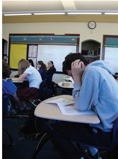
Students decide what stocks to buy