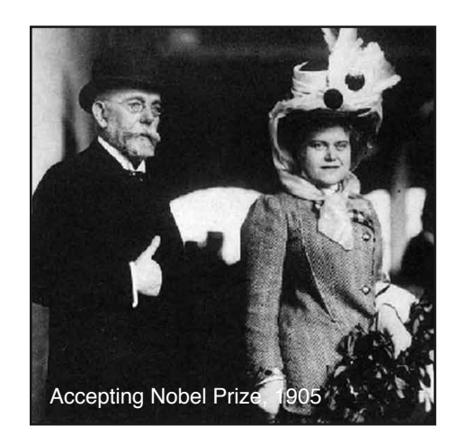
Continued on page 6

But Koch also wanted to know whether anthrax bacilli that had never been in contact with any kind of animal could cause the disease. He obtained pure cultures of the bacilli by growing them on the aqueous humour of the ox's eye. By painstakingly studying, drawing and photographing these cultures, Koch recorded the multiplication of the bacilli and noted that, when conditions are unfavourable to them, they produce rounded spores that could resist adverse conditions, especially lack of oxygen and that,