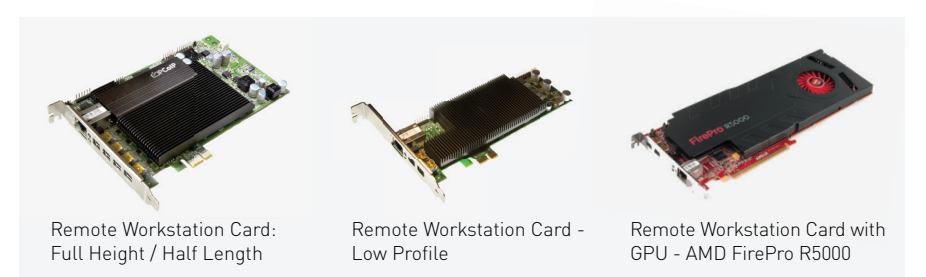
FIGURE 2: PCoIP functionality is deployed in a range of hardware options to serve the needs of virtually any application and system configuration

All Remote Workstation host cards can stream audio and USB data across the network to the client device. And since they are driver-less, PCoIP Remote Workstation cards are compatible with any platform, regardless of what operating system the host is running.