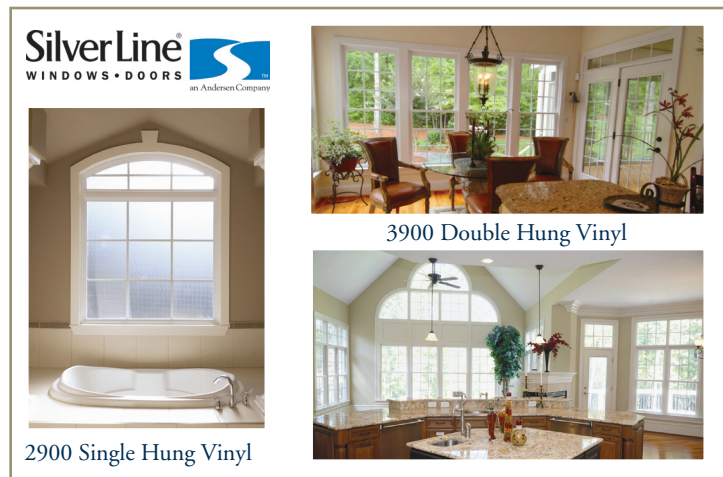
2900 Single Hung Vinyl

Installing or replacing windows & screens can be an arduous undertaking, so why do it yourself? At Barefoot & Company we alleviate any concerns you may have and provide the quality you deserve.