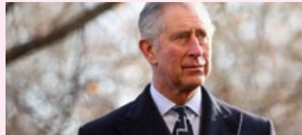
HRH Prince of Wales Environmental campaigner; future King