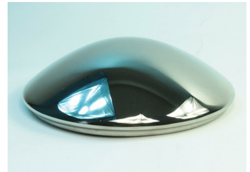
Chrome plated steel for vintage hub cap 10.50” diameter. X 3.125” height x 16 gauge made on a hydroform press. v