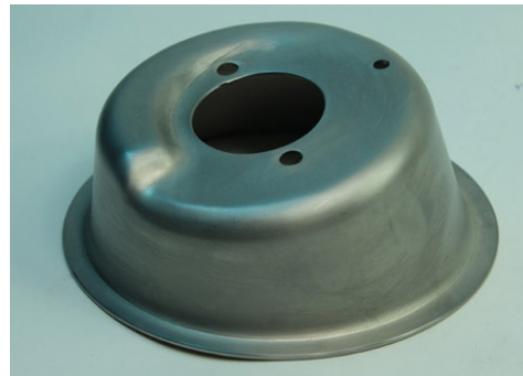
13 gauge 304 s/s spring retainer 6.5” diameter X 3.00” height made on a hydroform press.