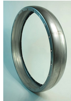
Steel ring housing used on sewer cleaning equipment. 7.00" wide X 42.00" diameter X 0.154" thick steel.