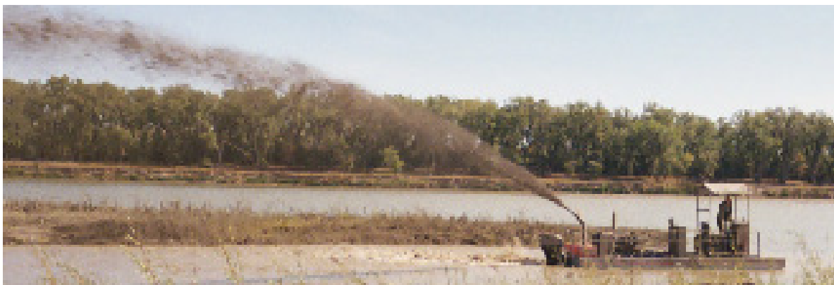
Crisafulli Cobra Cutterhead