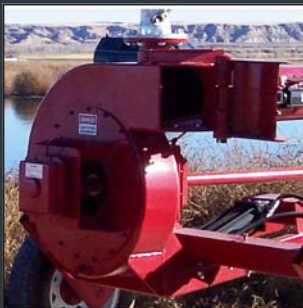
SRS Crisafulli specially engineered Slurry Gate