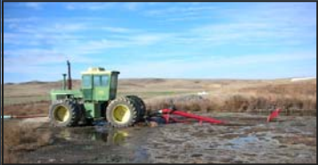
A hydraulically controlled lift axle with a 7 foot lift

Call for a free Specification & Quote 800-442-7867