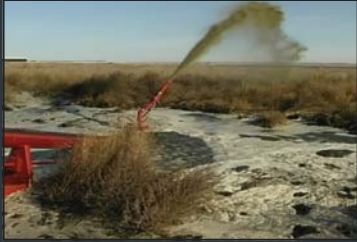
Nozzle adjusts to 74 degrees of vertical movement and 320 degrees of rotation.

Call for a free Specification & Quote 800-442-7867