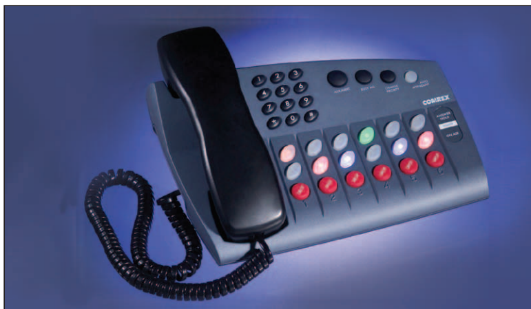
At the 2011 NAB Show, Comrex introduced the STAC VIP, its IP-based phone system.