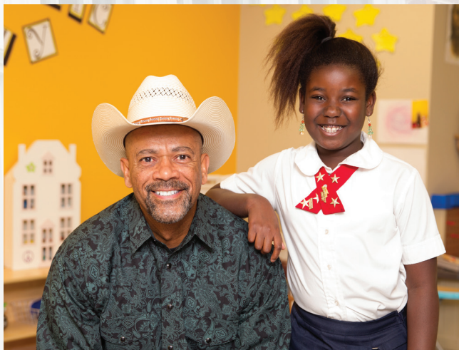
Sheriff Clarke visits the ECC for the Open House

The ECC is on green: strong scholars, parents and teachers never gave up hope that St. Marcus would be their home.