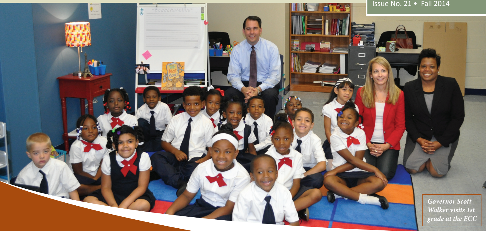
Governor Scott Walker visits 1st grade at the ECC