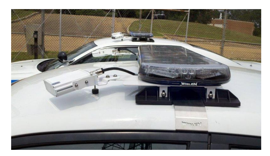
Top view of Jackson, MS. police vehicle with LPR camera

and keeping criminals off the street. The possibilities are endless, since they can add up 1000 different hotlists. This can include local drug trafficking, sex offenders, etc.