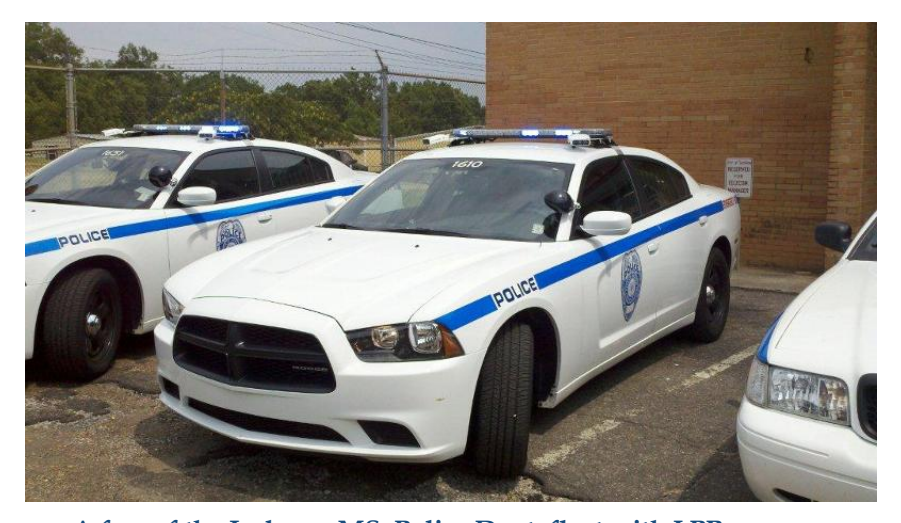
A few of the Jackson, MS. Police Dept. fleet with LPR cameras

In discussing the world of Video Surveillance today, we have now transitioned into a new kind of camera. These cameras are referred to as LPR (License Plate Recognition) cameras, which add a whole new meaning to the term "Big Brother". With LPR technology, surveillance cameras has moved to an entirely new era.