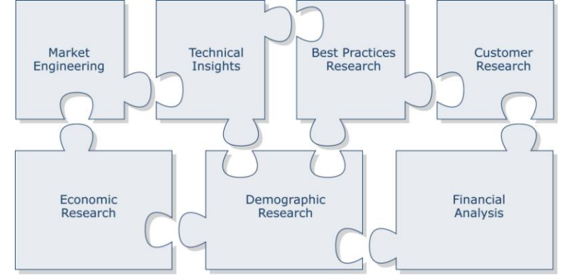
Chart 4: Benchmarking Performance with TEAM Research

Frost & Sullivan's TEAM Research methodology represents the analytical rigor of our research process. It offers a 360-degree view of industry challenges, trends, and issues by integrating all seven of Frost & Sullivan's research methodologies. Our experience has shown over the years that companies too often make important growth decisions based on a narrow understanding of their environment, leading to errors of both omission and commission. Frost & Sullivan contends that successful growth strategies are founded on a thorough understanding of market, technical, economic, financial, customer, best practices, and demographic analyses. In that vein, the letters T, E, A and M reflect our core technical, economic, applied (financial and best practices) and market analyses. The integration of these research disciplines into the TEAM Research methodology provides an evaluation platform for benchmarking industry players and for creating high-potential growth strategies for our clients.