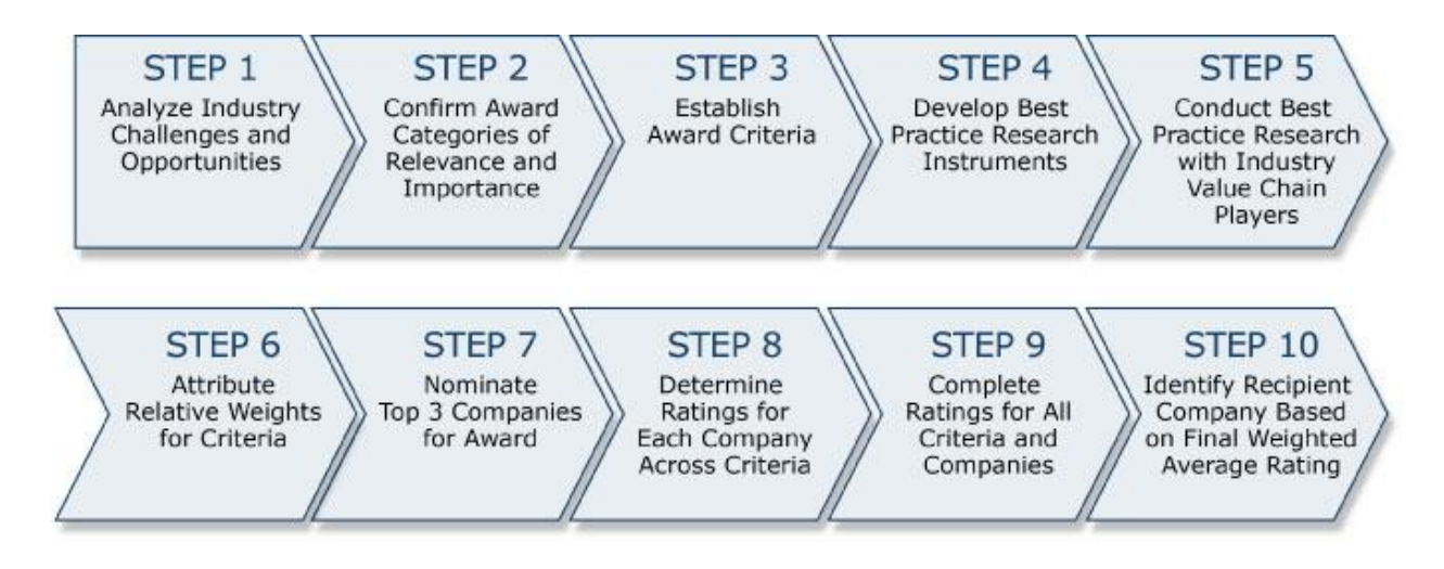
Chart 2: Frost & Sullivan's 10-Step Process for Identifying Award Recipients

This exercise encompasses all criteria, leading to a weighted average ranking of each company. Researchers can then easily identify the company with the highest ranking. As a final step, the research team confirms the veracity of the model by ensuring that small changes to the ratings for a specific criterion do not lead to a significant change in the overall relative rankings of the companies.