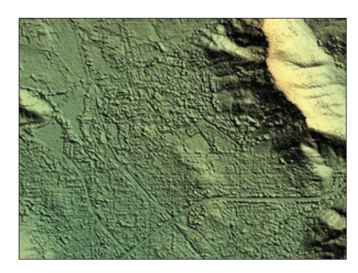
Digital Surface Model Ground Sampling Distance: 5m Vertical Accuracy: 1m LE90% in open land of slopes less than 10 degrees.

Intermap's highly skilled people, development of advanced technology, and continuous refinement of our data processing and editing procedures enable us to provide accurate data that satisfies your geospatial needs.