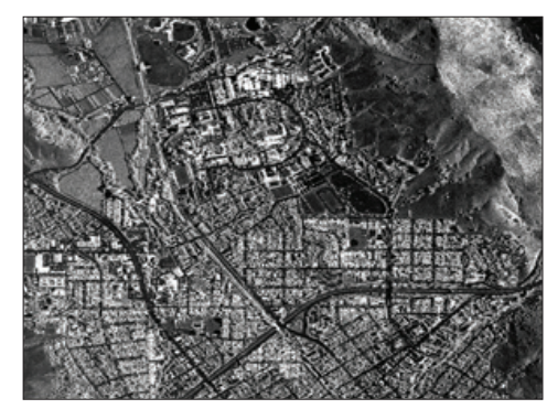
Orthorectified Radar Image Pixel Resolution: 1.25m Horizontal Accuracy: 4m CE90%