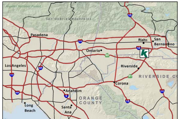
KANE's Southern California Facility 2304 S. Lilac Avenue, Bloomington, California

Dependable People. Exceptional Logistics.