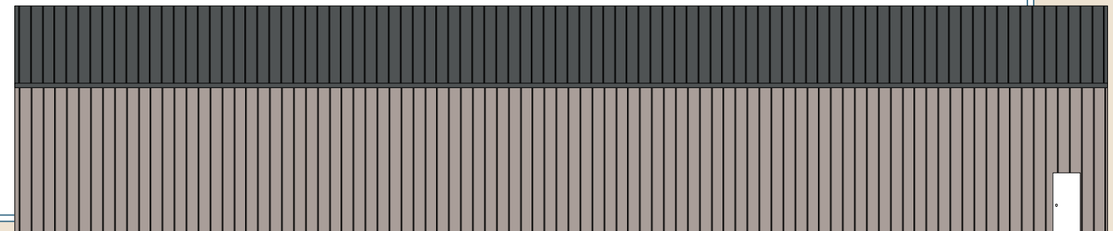
120' Side Elevation