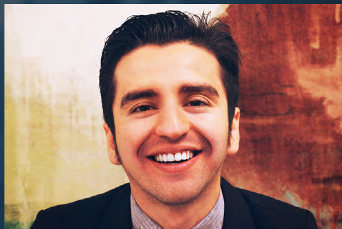
After Six Month Smiles® and Veneers

Quickly and discretely resolve non-compliant aligner cases.