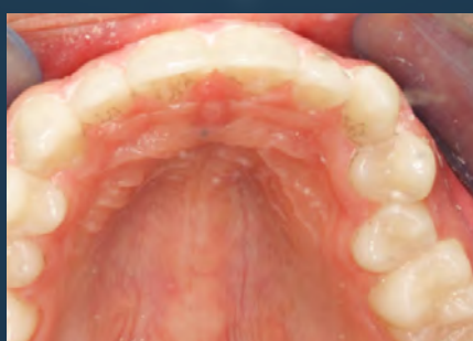
After 2.5 Years with Aligners