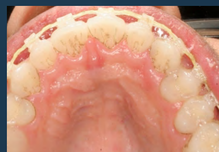
3 Months with Six Month Smiles®