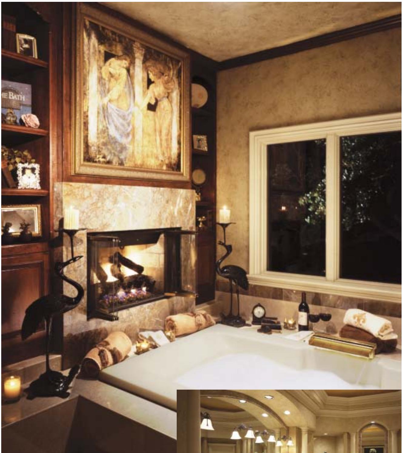
A former den, pictured top left, was transformed into a spectacular wine cellar with French rubbed mahogany cabinetry. An Italian tile medallion, bottom left, is a grand addition to the home's rotunda. The master bath, this page, is a spa-like retreat complete with a fireplace at the end of the deep whirlpool tub.