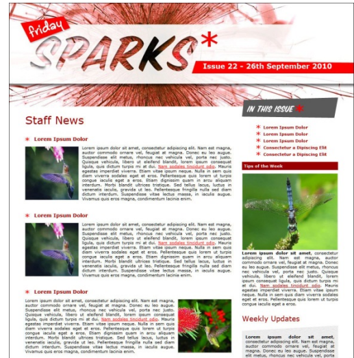
Benefits Communication tool: SnapMag Internal Newsletter tool